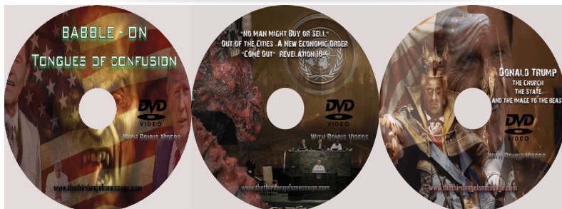
Babble On Tongues of Confusion