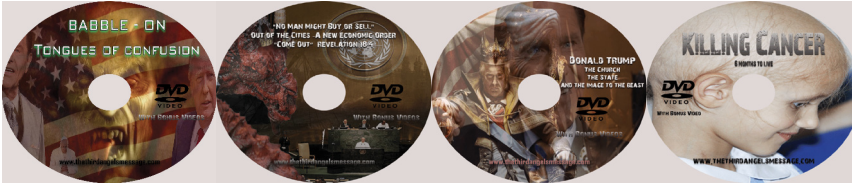
Babble On Tongues of Confusion