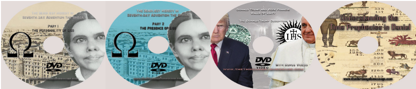
The Omega of Deadly Heresy the Personality of God 1