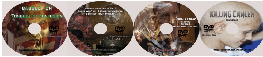
Babble On Tongues of Confusion